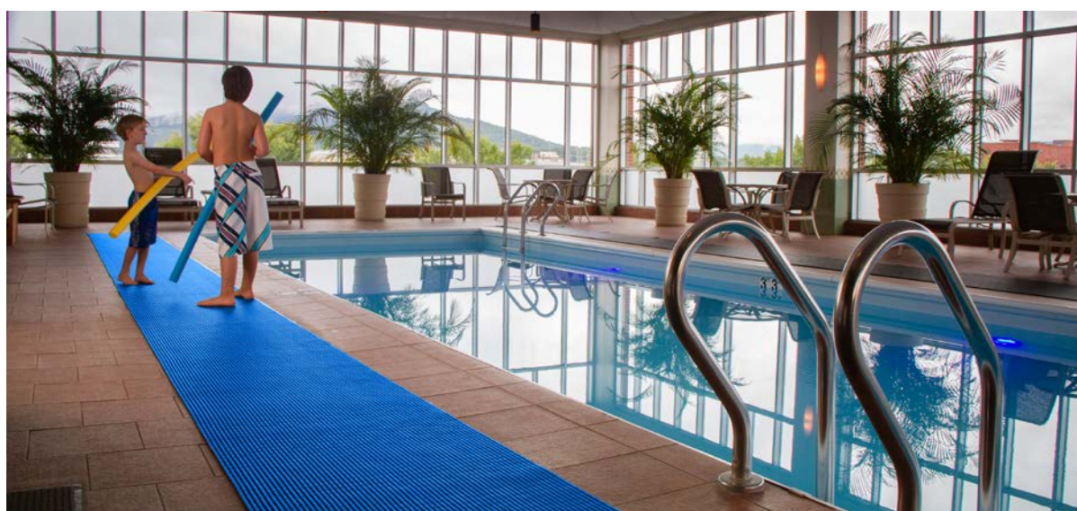
WetMat is installed to secure the edges of a pool in Alsace, France