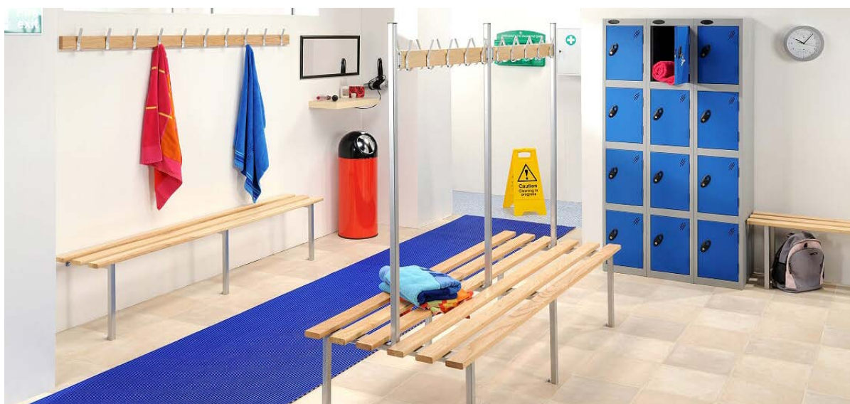
WetMat is installed in a locker in St-Nicolas de Port, France